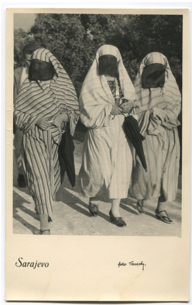
Muslim women's streetwear