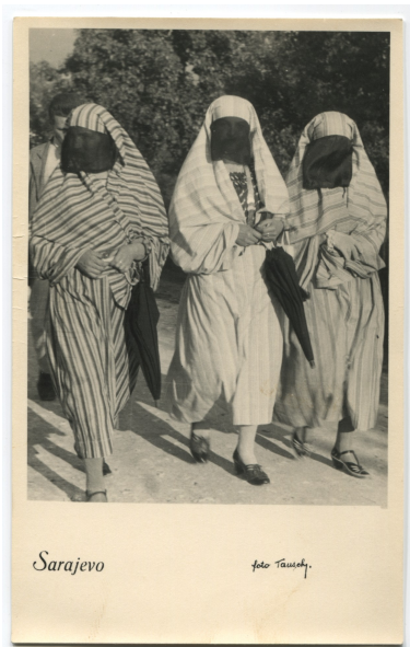
Muslim women's streetwear