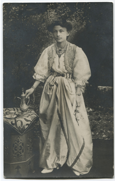
Muslim women's town costume © Museum of City of Sarajevo