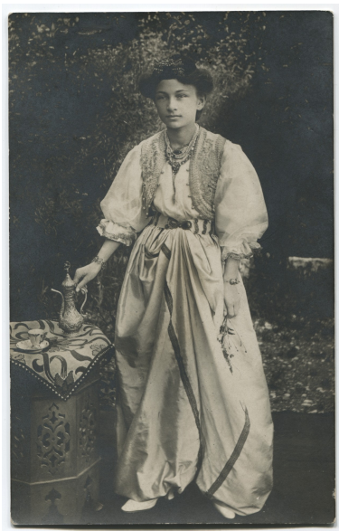
Muslim women's town costume