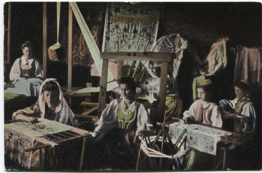
Interior of the manufactory for weaving, embroidery and stitching lace