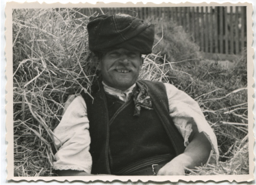
Portrait of a peasant