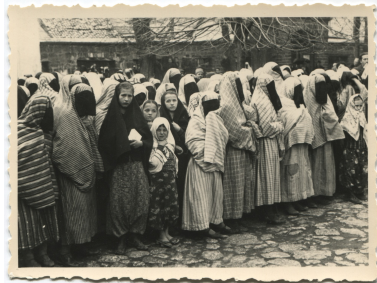
Muslim women and girls in the courtyard of the Gazi Husrev Bey's mosque