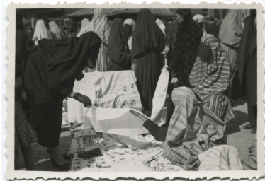
Market in Baščaršija