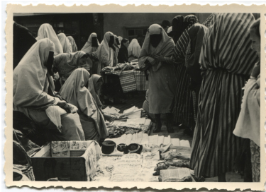
Market in Baščaršija