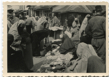
Market in Baščaršija