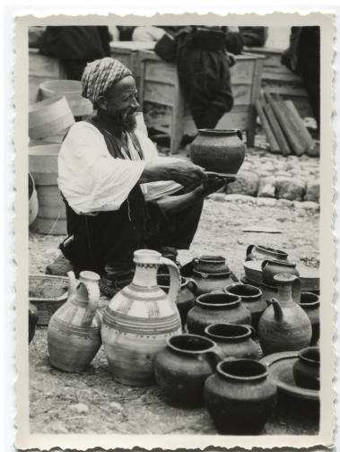
Selling pottery