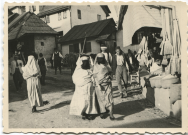
Street scene near the Nadkovači graveyard