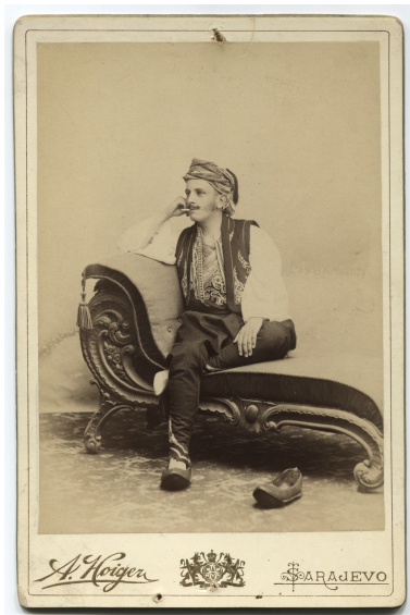
Studio portrait of a man in traditional clothes