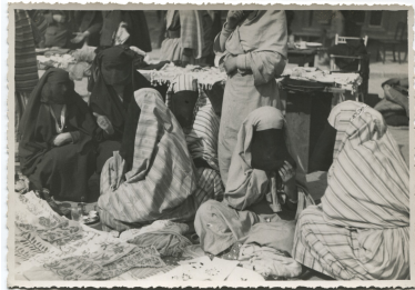
Market scene