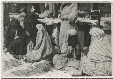
Market scene