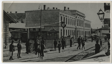
Railway station