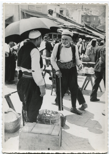
Market scene