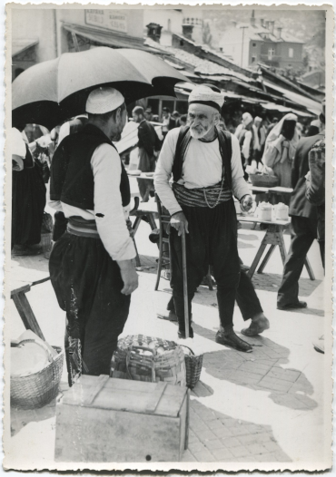
Market scene