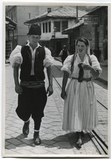
Folk costumes