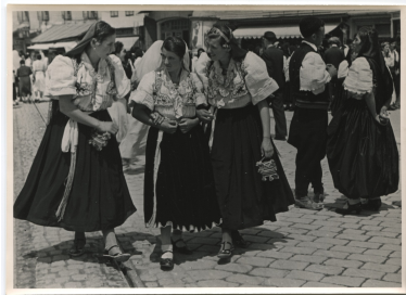
Traditional women's folk costumes