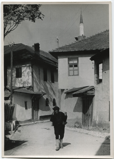
Street scene in a residential quarter