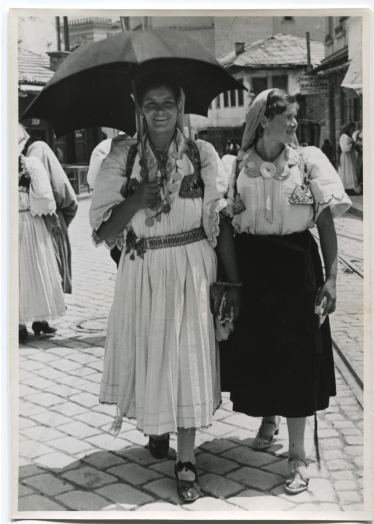
Christian women's folk costumes