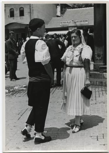
Folk costumes