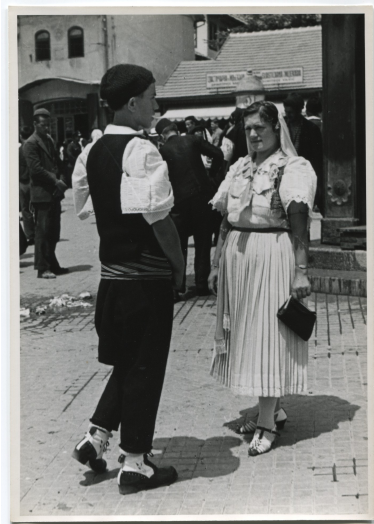
Folk costumes