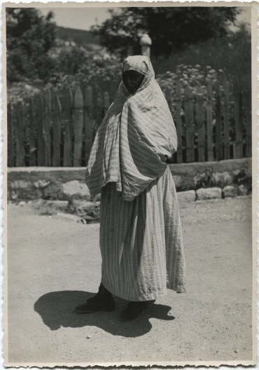
Muslim women's streetwear