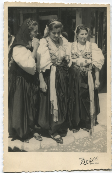
Traditional women's folk costumes