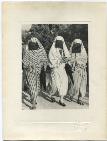
Muslim women's streetwear