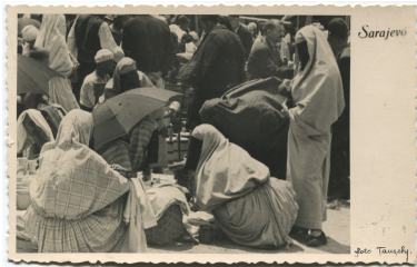
Market scene