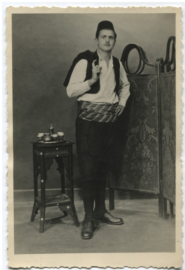
Studio portrait of a man