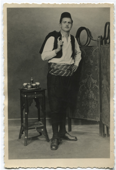
Studio portrait of a man