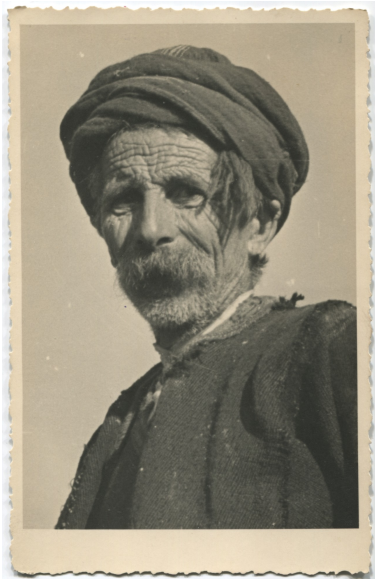
Portrait of an old peasant