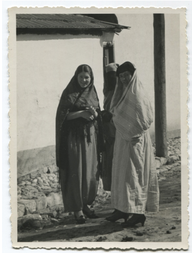
Women in the street