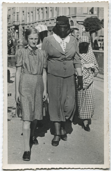
Muslim women's streetwear