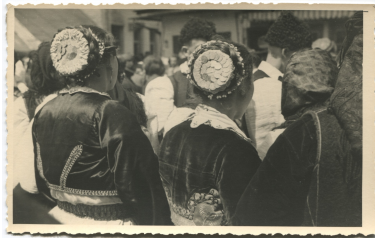
Traditional headgears