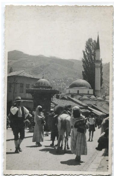
At the Sebilj fountain