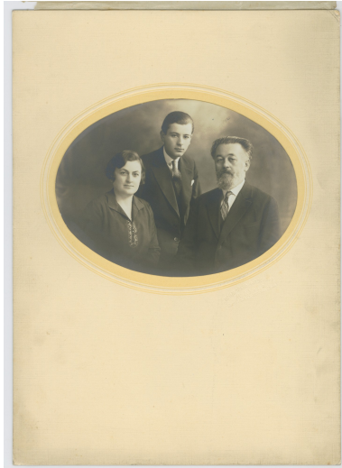
Studio portrait of the Ankov family