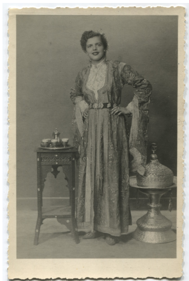
Studio portrait of a woman