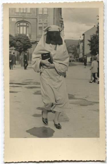
Muslim women's streetwear