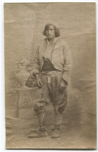
Studio portrait of a young man