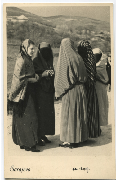
Group of women talking in the street