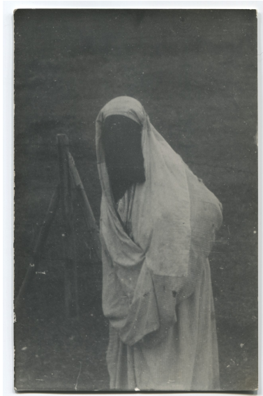
Muslim women's streetwear