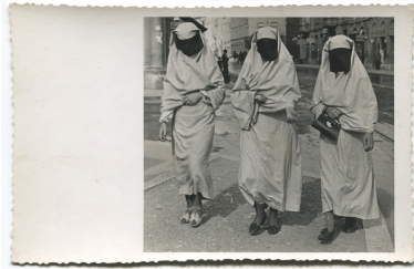
Three Muslim women walking in the street near Marijin Dvor (Mary's house)