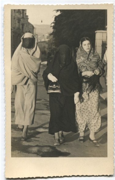
Two Muslim women and a girl in the street