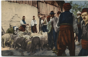
Cattle market