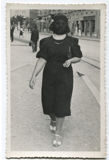
Muslim woman in the street