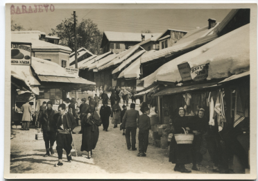
Shops at the bottom of Kovači street