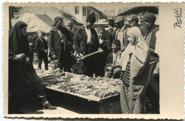
Market scene