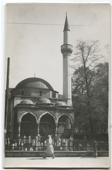
Ali-Pasha's mosque