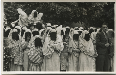
Muslim women's streetwear from the interwar period