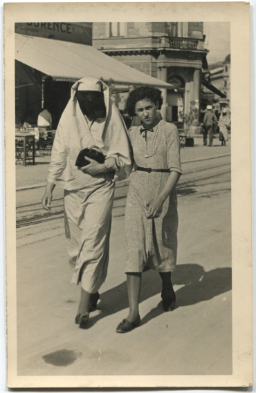
Muslim woman and a girl in the street