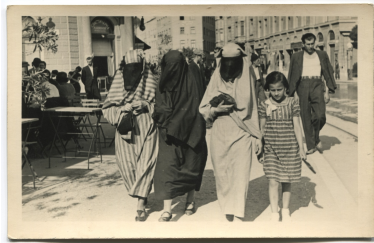
Muslim women's streetwear from the interwar period