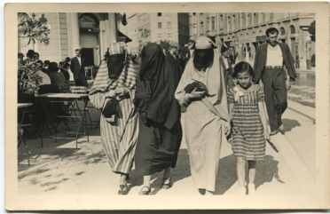
Muslim women's streetwear from the interwar period