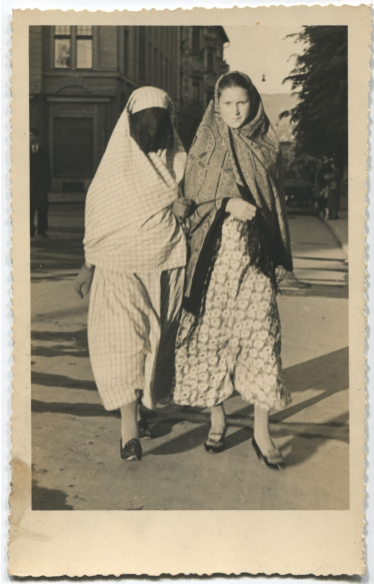
Muslim woman and a girl in the street