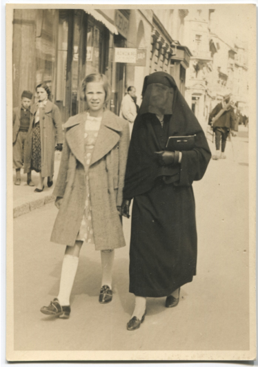
Muslim woman and a girl in the street