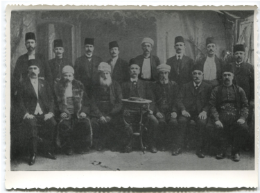
The Executive Committee of the National Muslim Organisations („Muslimanska narodna organizacija“ )