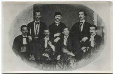
Serbian merchants