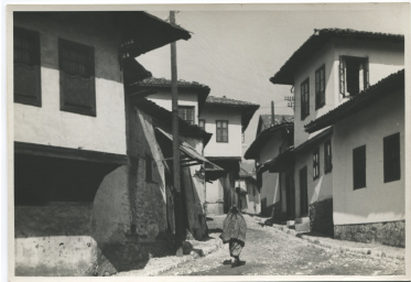
Street scene